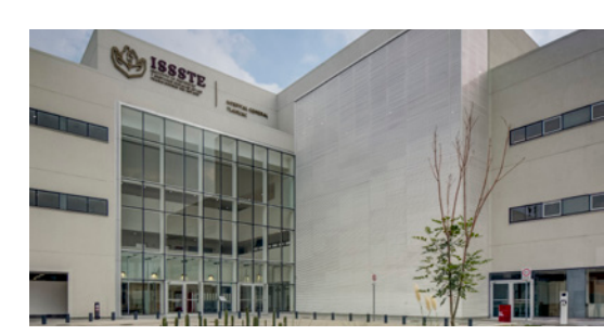
The Hospital de Tláhuac shortly before commissioning.

The bearings are designed for seismic movements of up to \pm 400 mm. They feature a height of 420 mm and an outline with a diameter of 850 mm. The vertical lead core is located in the center, surrounded by horizontally placed natural rubber layers with a thickness of 11 mm each, which are alternately vulcanized onto 3 mm thick steel plates.