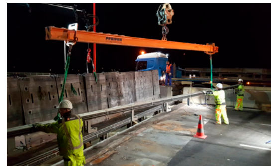
Lifting into position of the second pair of center supports in front of 'wall' of the opened MMBS elements. Less than 10 minutes later, traffic was flowing again on one lane.