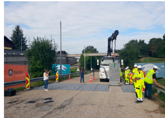
Six placed and one unfolded MMBS element undergoing a test.