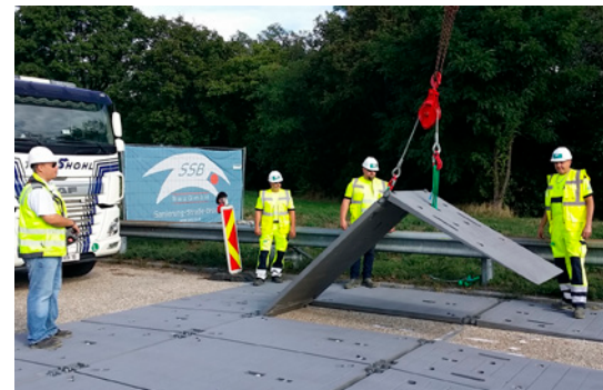
Scrutinizing looks during the functional test of an MMBS element.