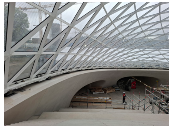
A view from inside showing the "feet" of the lattice shells. Around two dozen spherical bearings support the steel and glass structure. These allow for three-dimensional movements in some cases, with two of the bearings absorbing horizontal forces.