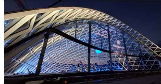
The new main station in Stuttgart will have four lattice shells covering the entrances.