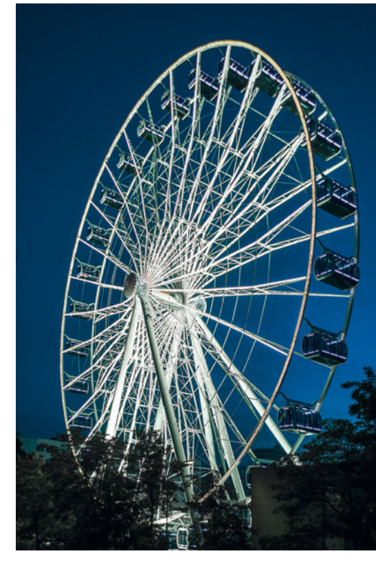
WOM, Wheel of Munich

The family-owned company employs staff from almost 30 nations. By combining experience and tradition with new ideas and influences, groundbreaking developments emerge, which, for instance, reduce traffic noise, make buildings in seismic areas more secure, or protect the residents in the stylish loft in the 80th story against sea sickness.