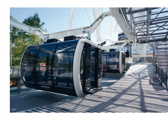
Access area and platform