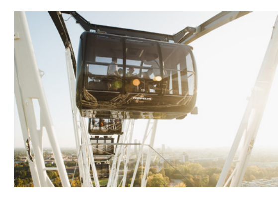
Zeppelin cabin, Ferris wheel type R80XL