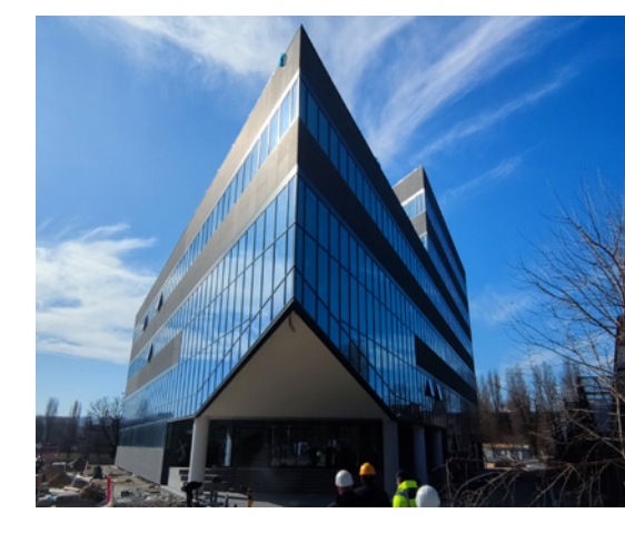
The BioSense Institute in Novi Sad in February 2023.