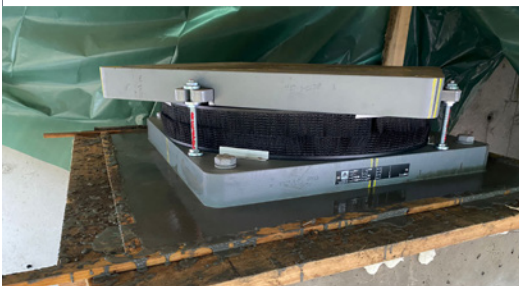
Precise embedding in concrete of the SIP*-V-bearings. Brushes protect the sensitive sliding lens (puck) against dust.