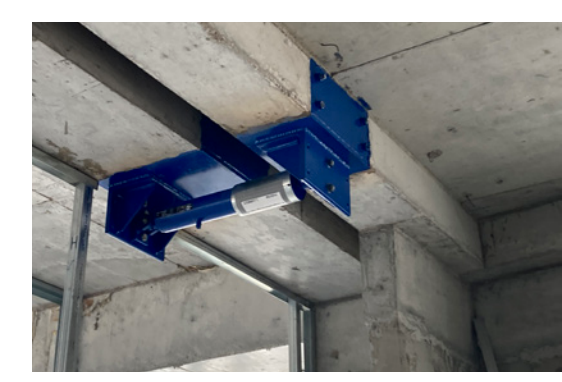
One of the four hydraulic dampers to protect the narrow building core against tilting.