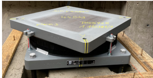
Swivelling a SIP®-V-bearing into position to protect the building core.