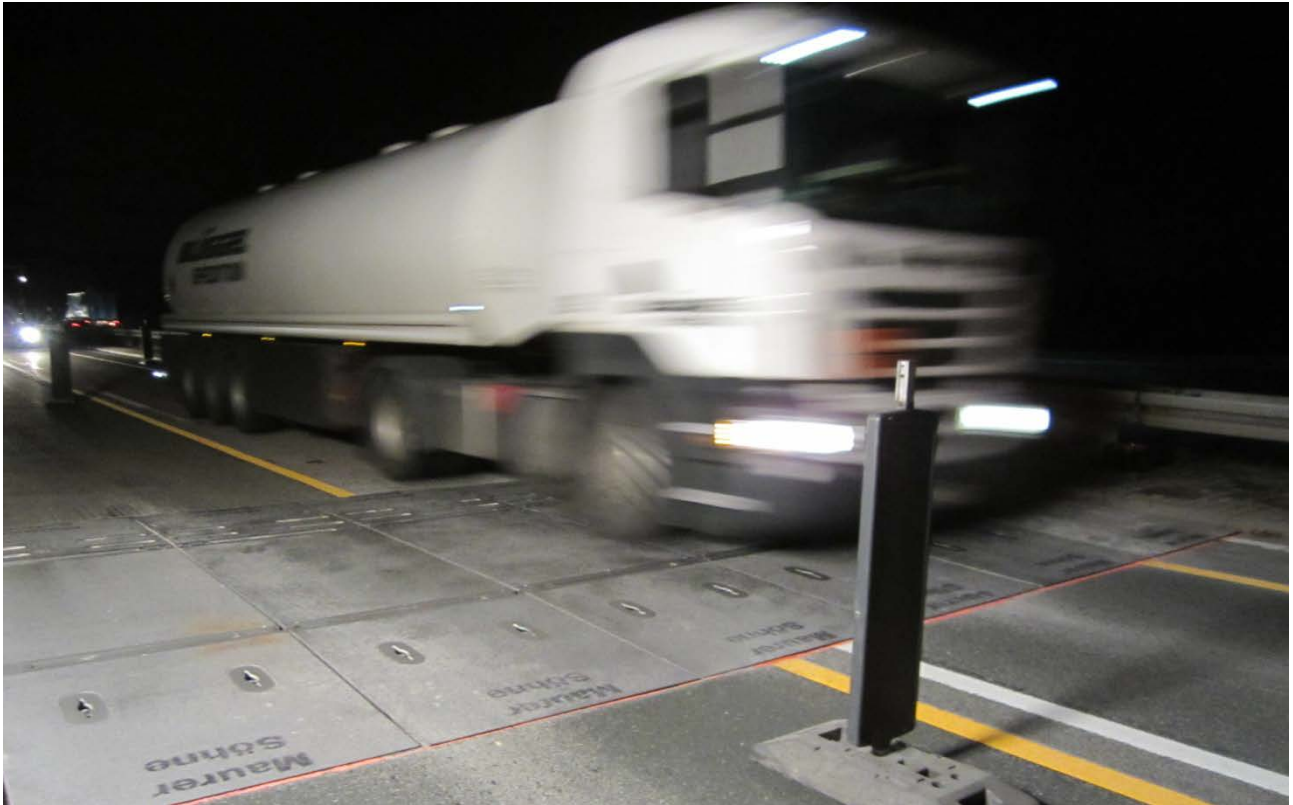
MAURER MMBS® - Modular bridging system in service

In the former West Germany, the majority of bridges were constructed between 1960 and 1980. In former East Germany it commenced in 1990. Depending on the time of construction, a big increase in terms of strain for these bridges can be noticed. Be the cause in an increase of load cycles or in terms of wheel loads, the existing bridges require manifold actions for their strengthening. The budget for the maintenance of federal roads and bridges is estimated to be annually 3 billion Euro, and this for the next decade. The share of this budget for engineering structures like tunnels and bridges is in the range of up to 45%. The expansion joints count among the structural members with the highest strain, which means that in case of replacement often comprehensive procedures have to be implemented to control the traffic flow. By way of the "MMBS" system, MAURER offers a possibility for minimizing such detrimental effects to the traffic flow. The usage of a mobile bridging system will contribute to an essential relaxation of the traffic situation: