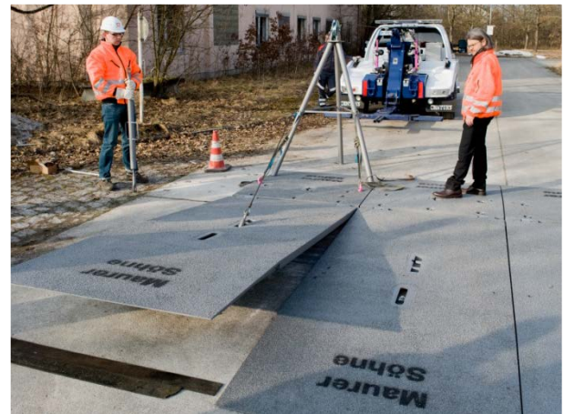
Fig. 2 - Opening with wrench and tripod