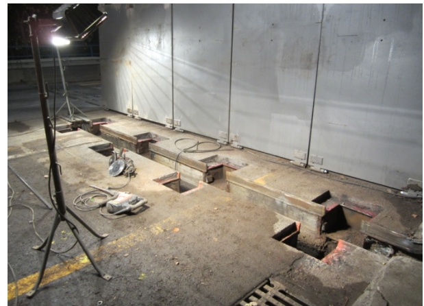
Fig. 4 - Job site